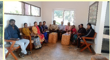
at Coorg Vismaya

Thank you for your prayers for Pravaham. We requested prayers for 10 students to receive sponsorship for the training at Pravaham, in our Newsletter, Dec. 2022 . God in an amazing way met the need and we thank all the friends who came forward to sponsor the students.