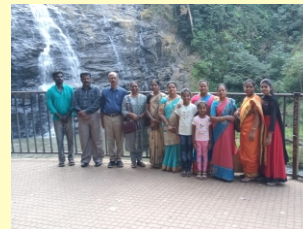
at Abbey falls, Coorg