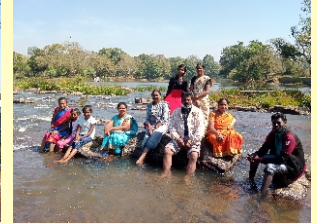
at Dubare elephant camp