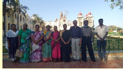
at Mysore Palace

Pravaham team went on a 3 day trip from 17 th to 20 th January 2023 to Mysore and Coorg, after a gap of 6 years. It was a wonderful time of bonding, fun and adventure for the 11 staff who went on the trip. They came back refreshed and rejuvenated.