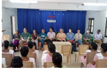
Faculty and students of Colombia theological seminary, U.S.A. 9 th January 2023