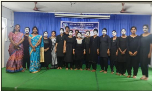
1 st year students of Masters in Social work , Auxilium College, Vellore, gave awareness on gender equality, women empowerment and how not to misuse the social media to the students, on the 17 th October. 2022.