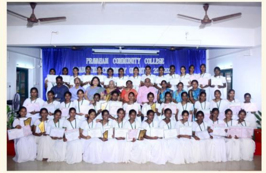
18th batch Graduates 2021-22