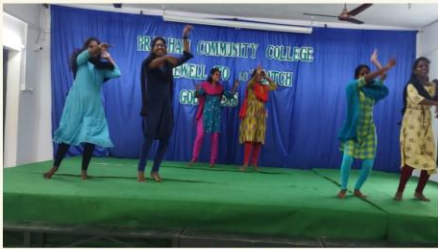
Farewell to 18 th Batch

'Farewell Party' was arranged for the out-going students by the 19 th batch students on the 9 th September 2022. It was an emotional moment for everyone in Pravaham to bid farewell to the students.