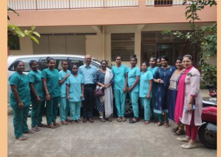
Advantage Elder care Home, Bangalore