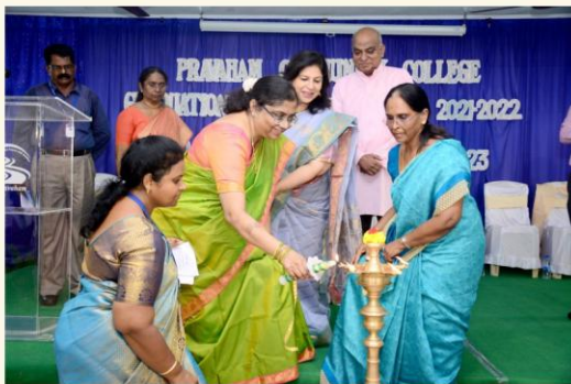
Lighting of kuthu vilakku by the Guests of Honour