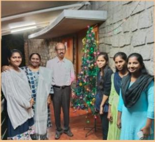
Spring Valley senior citizens' community, Vellore

We were invited for the Christmas program of the Spring Valley senior citizen's community near Vellore. Six of our students are working in Spring valley. We were very happy to see the students cheerfully taking care of the elderly.