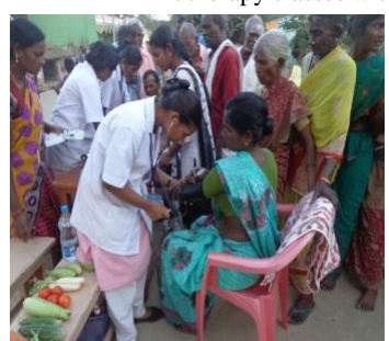
Students taking BP at an awareness camp