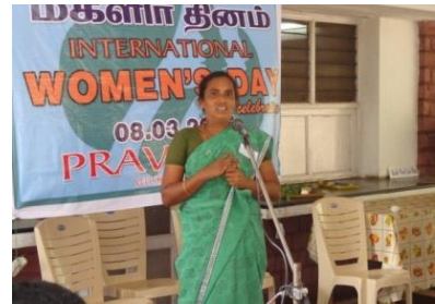
International women's day at Pravaham