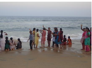
Students giving a talk on hygiene at on excursion to Chennai playing at the beach the school outreach program