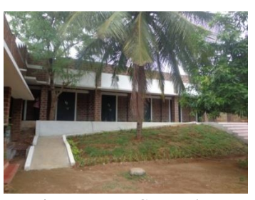
Learning Resource Centre phase II