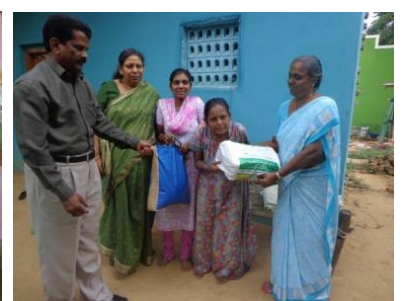
Pravaham staff visiting the single parents' homes with gift hampers