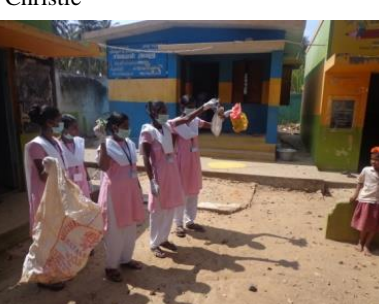
cleaning the village