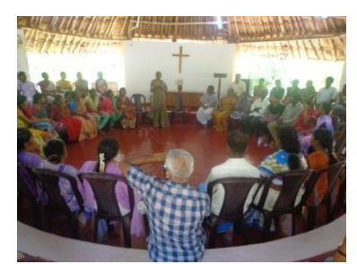
Students with their Parents at family Counselling program