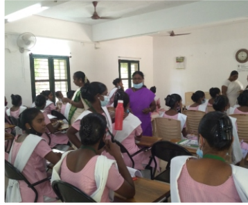
Health team from Thimiri Primary Health Center distributed free sanitary Napkins and Folic acid tablets 24 th June 2022.