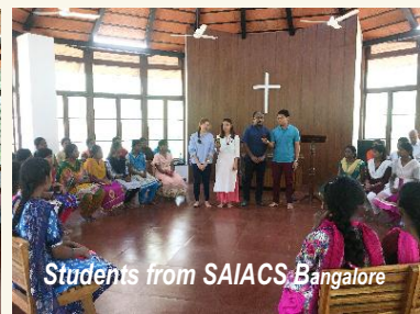
Students from SAIACS Bangalore